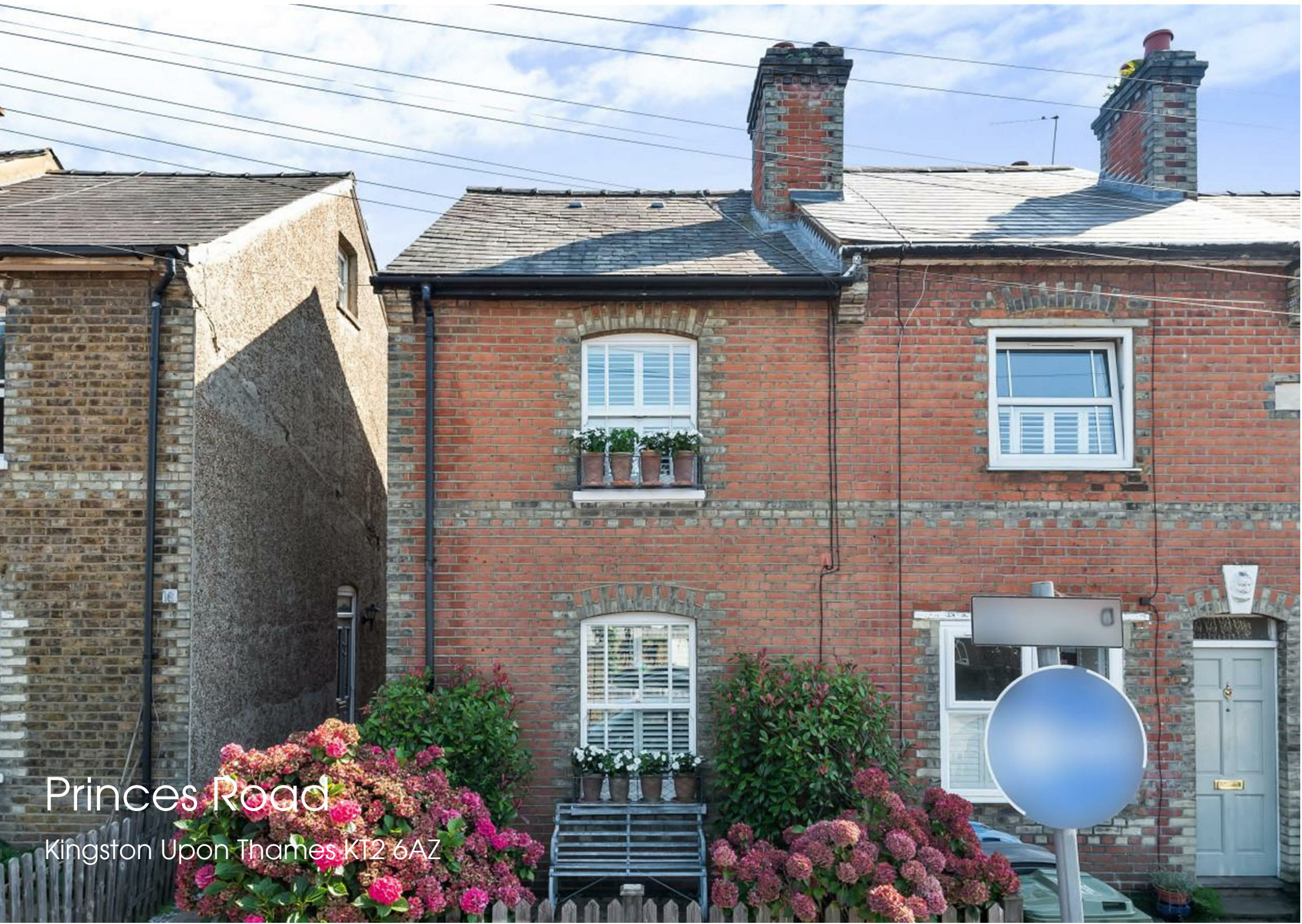
Princes Road Kingston Upon Thames KT2 6AZ